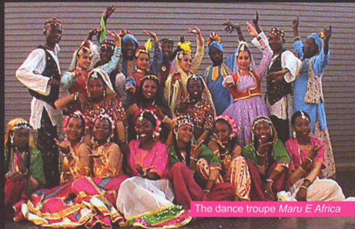
The dance troupe Maru E Africa