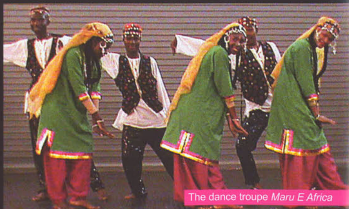
The dance troupe Maru E Africa

So be sure to book your ticket today at Computicket and the Lyric theatre Box office - Tickets are selling Fast!